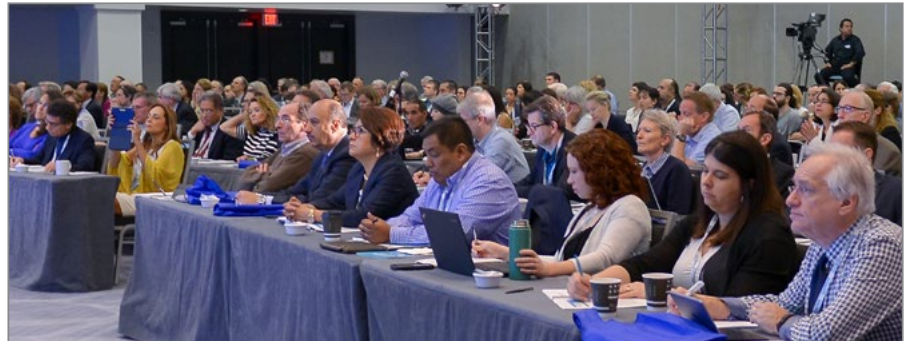
260 experts coming from 30 countries attended the Gut Microbiota for Health World Summit in Miami

Since 2012 when the first GMfH World Summit took place this meeting has become a leading platform of scientific exchange for gut microbiota experts from all over the world. This tradition was strongly confirmed by the GMfH 2016 World Summit in Miami, which attracted 260 internationally renowned gastroenterologists, hepatologists and microbiologists as well as nutritionists, dietitians and general practitioners coming from 30 countries. The event was organized by the Gut Microbiota & Health Section of the European Society of Neurogastroenterology and Motility (ESNM) and the American Gastroenterological Association (AGA) together with the European Crohn's and Colitis Organisation (ECCO) and the European Society for Paediatric Gastroenterology, Hepatology and Nutrition (ESPGHAN) and with the support of Danone and Biocodex. Eleven talks and six workshops