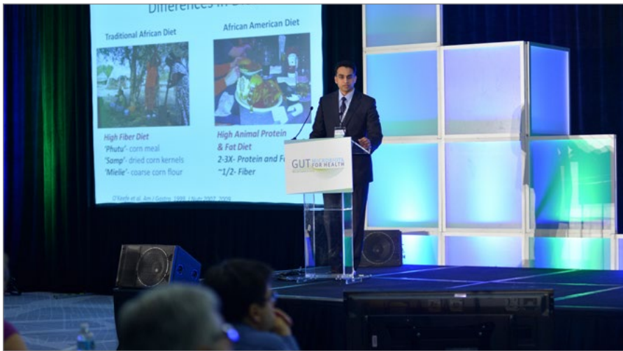
World-leading experts presented exciting research results in eleven lectures and six workshops

potential pathogens then reach the liver and activate its immune system. A promising approach towards novel therapies is the stabilization of the gut barrier by restoring the underlying gut microbiota imbalance through intake of probiotics. Recent trials show that Lactobacillus strains can restore the microbial equilibrium and reduce the amount of pathogens in liver patients.